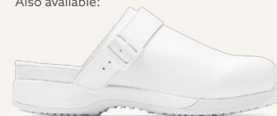
Triston CT White: 80046